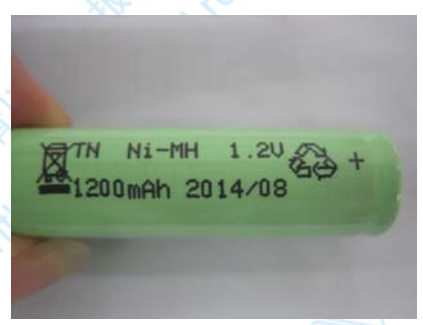
Authenticate the photo on original report only